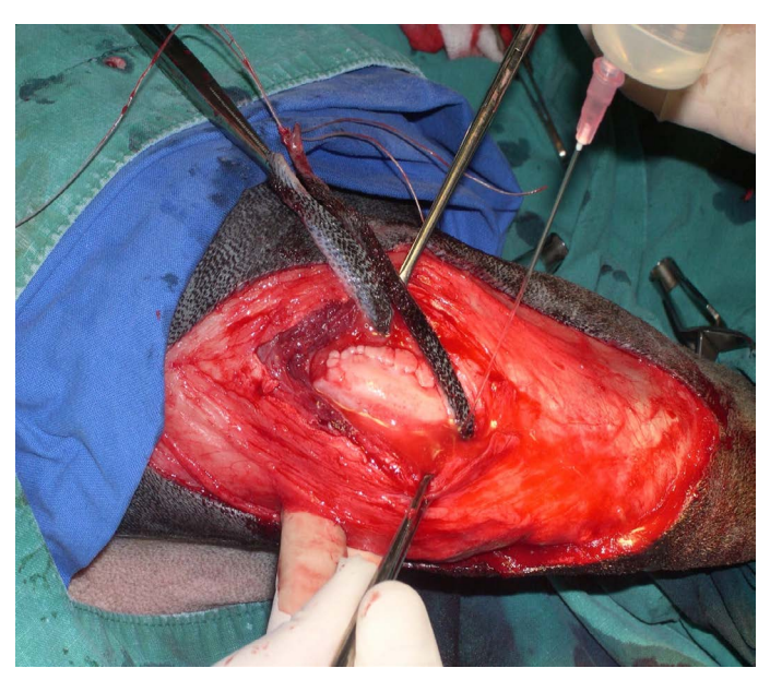
Figure 2. The questions vets and clients ask are often different, but they all matter

lock the graft into the femoral tunnel from the articular side, and there is a large amount of literature reporting technical points on anchorage.