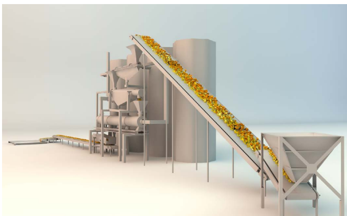
Figure 3. The 3D image of drying system

protein, crude fiber and nitrogen free extract content were determined according to AOAC [2]. NDF and ADF levels were detected in 200 Ankom Fiber Analyzer according to Van Soest et al. [3]. Organic matter digestibility (OMD) values of dried citrus pulps were determined by using Hohenheim gas production system after the end of 96 hours incubation. Metabolic energy (ME) was determined according to MAFF (1984). The percentage of Ca, Fe, K, Mg, Na and P were determined by using ICP (Perkin Elmer® Optima™ 7000 DV ICP). The pH values of dried citrus pulps in rumen fluid were determined using the liquid pH meter (Sartorius portable pH meter PT-10). The colour and texture properties of the dried pulps were determined by using Hunterlab Colorflex EZ and Stable Micro Systems TA.XT Plus Texture Analyzer, respectively.