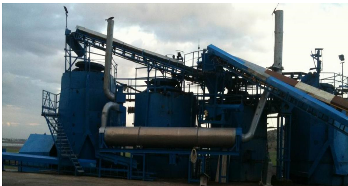
Figure 2. Photo of drying system