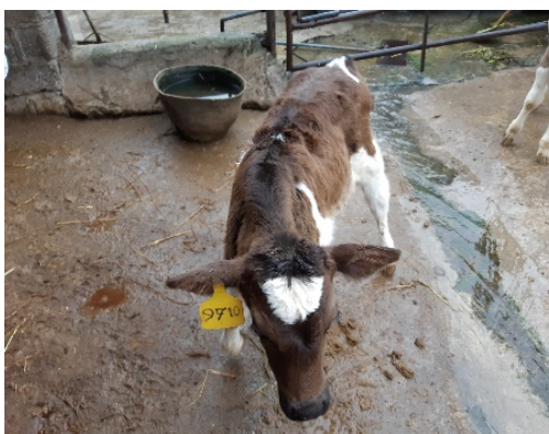
Figure 1. Sick calf