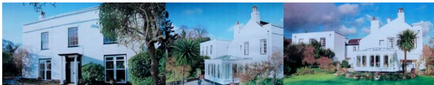
Figure 5. Brook House, Ringmore, Teignmouth, Devon: "An elegant Grade II Listed Regency house in a sought after village a short drive from Exeter" where the Bennetts lived in 1932, 1933 and 1935