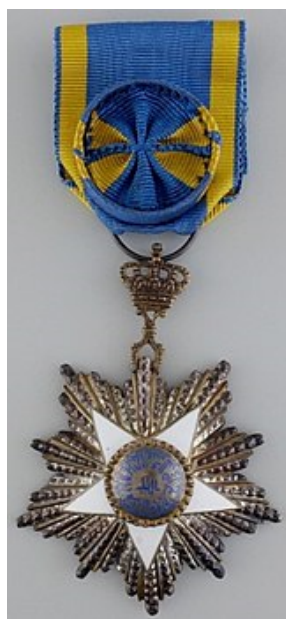
Figure 6. Breast badge of the Order of the Nile, Fourth Class

beginning of the 1939-1945 war until his retirement in the 1944 (Table 1). Unlike many other veterinarians in Sudan he does not appear to have served in the Sudan Defence Force. Towards the very end of his tenure he deviated again from his earlier course to write a paper on the pox diseases of sheep and goats [66]. This long paper with its rather grandiose title arose from the discovery of sheep pox which had not been previously known in Sudan although it had undoubtedly been present. Written together with two other authors who were already producing human smallpox vaccine the discussion centred on the need, or not, to vaccinate and the description of strains resistant to already available anti-pox vaccines.